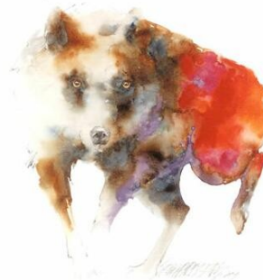
Auction items include a limited edition print, "Sweet Dreams," by artist Sarah Rogers of Sundance, Wyo.

The Friends of the Library will raffle off their "Fill Your Kitchen" basket that includes $200 for use at both local grocery stores, as well as all kinds of wine, cookbooks, gadgets and more. Raffle tickets are one for $1 and six for $5.